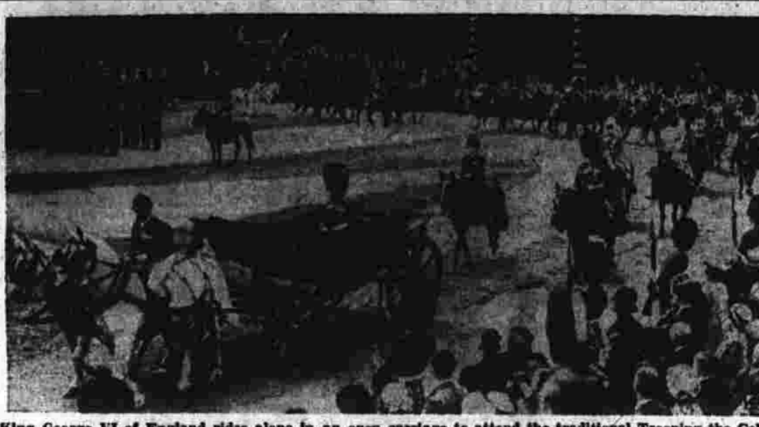
King George VI of England rides alone in an open carriage to attend the traditional Trooping the Color ceremony in London, honoring his official 53rd birthday and held for the first time since 1939. Behind him at left is his daughter, Princess Elizabeth, riding side-saddle, and at right, in bearskin cap, the king's brother, the Duke of Gloucester riders.